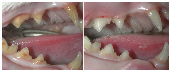
Comparison: Before and after dental treatment